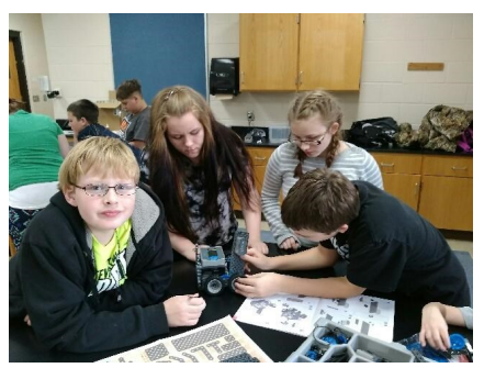
The 4-H After-School Robotics Club in Iosco County received a $1,000 Michigan 4-H Legacy Grant to use VEX Robotics as a tool to help club members develop life skills.

Awarded annually, the Michigan 4-H Foundation recently opened their grant and award opportunities for the 2021-2022 season. Open to 4-H volunteer leaders, members and staff, the grants and awards support local 4-H clubs and county programs, as well as recognize members of the 4-H community. All applications are due June 1.